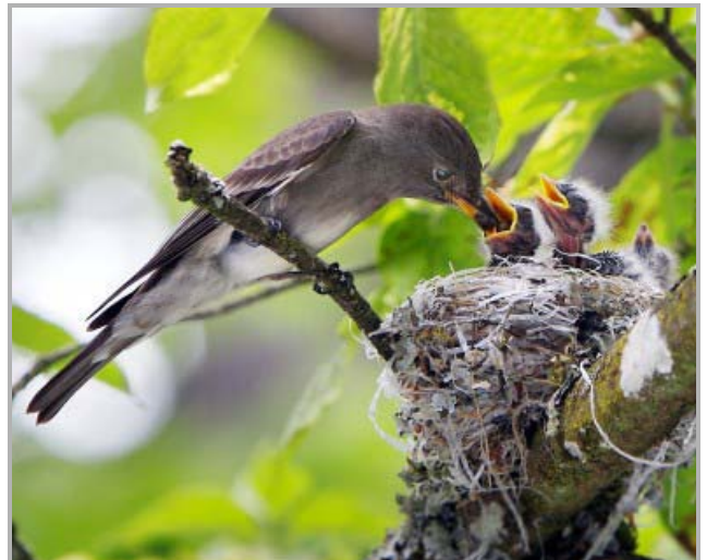
olive-sided flycatcher female with young